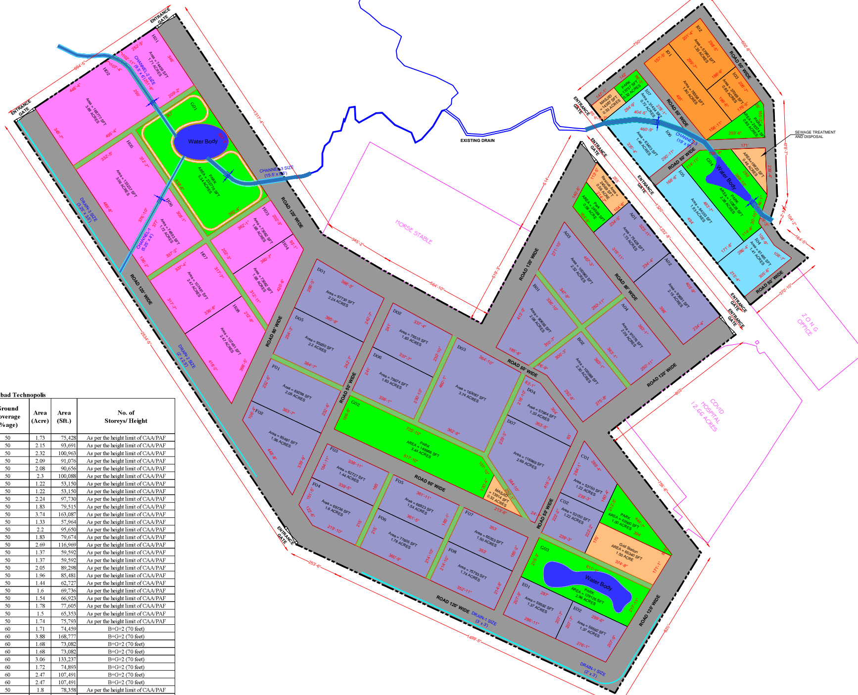
Design Parameters for Islamabad Technopolis